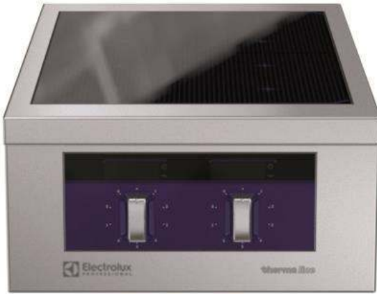
589015 (MCCBAEAO) Infrared Top, 2 zones, one-side operated